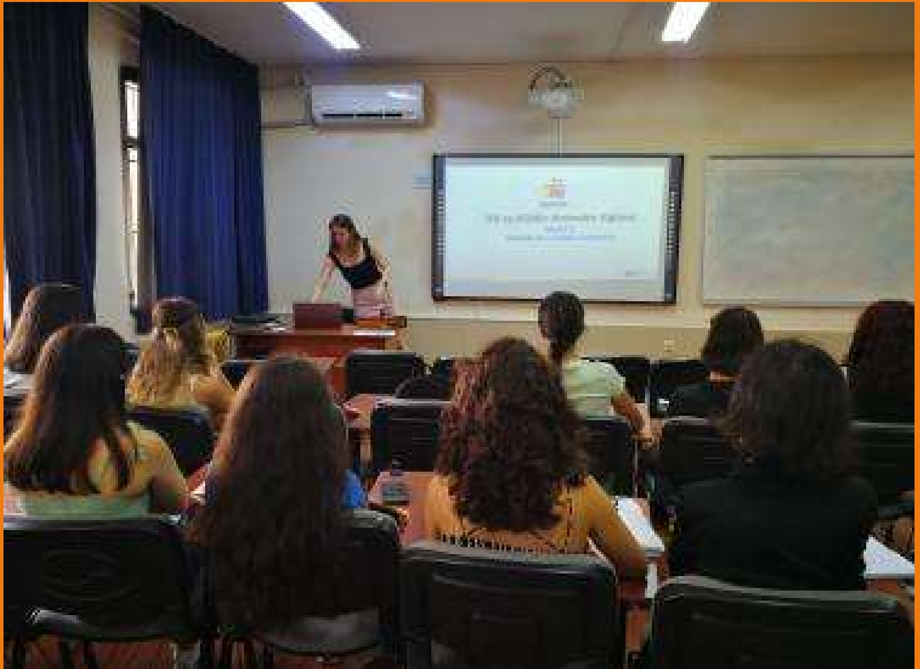
Photo: BRIDGE training course for L&CAs in Adana, Turkey