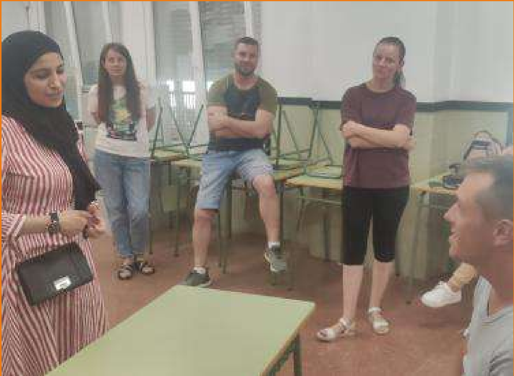
Photo: BRIDGE engagement work in Valencia, Spain