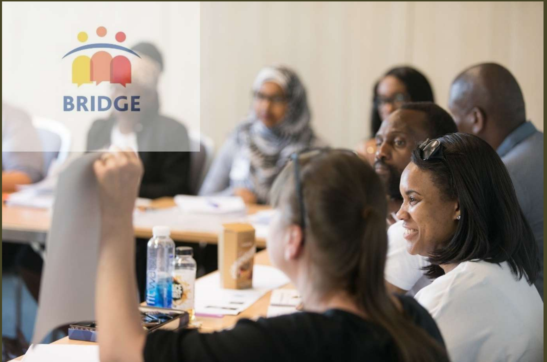
Photo: Language Club, Wandsworth, London, UK