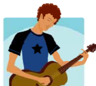
playing the guitar