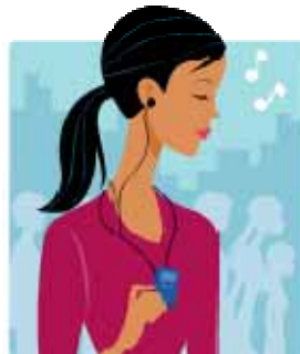
listening to music