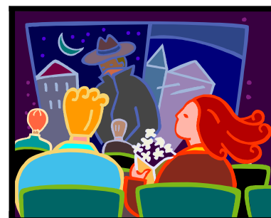
going to the cinema